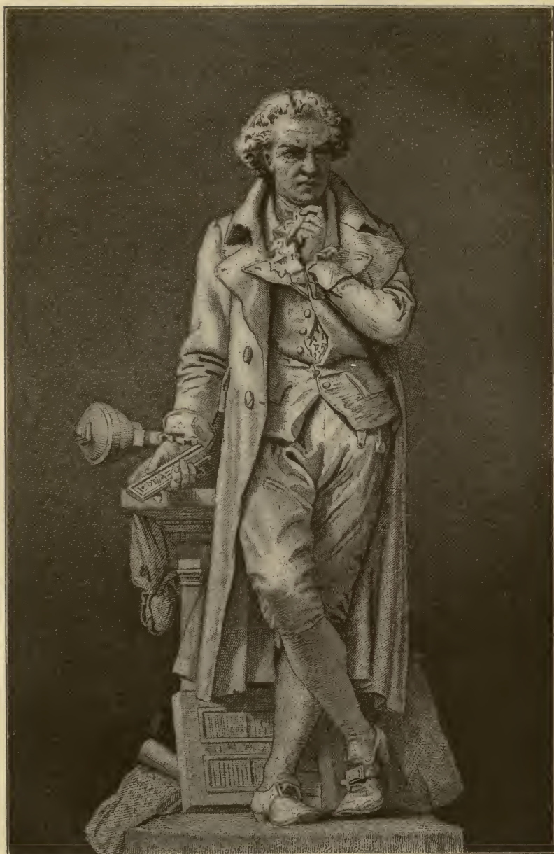
MONUMENT TO BODONI, ERECTED AT SALUZZO, OCT. 20, 1872